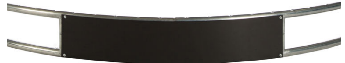
Example of how to attach the Wall Panels

Ensure the wall is as flush to the frame as possible.