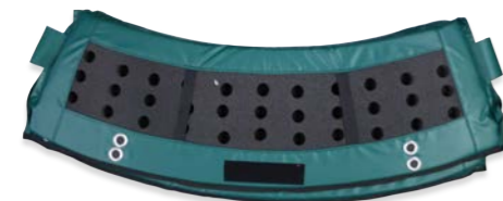
Safety Pads Quantity: 1