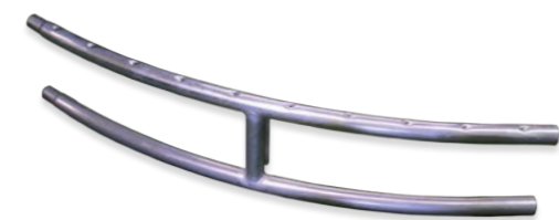
Top & Bottom Frame Sections Quantity: 8