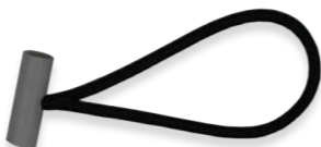
Elastic Toggles 8ft: 8 10ft, 12ft, 14ft: 16