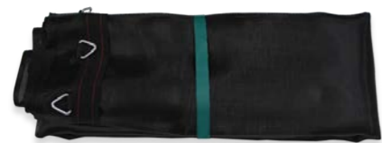
Jump Mat Quantity: 1