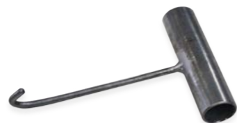
Spring Tool Quantity: 1