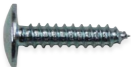
Screws Quantity: 32 (+2 Extra)