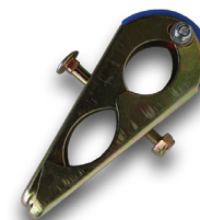
Clamps - only needed for certain trampolines.