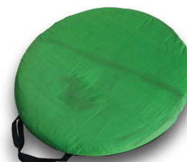
Trampoline Roof & Bag